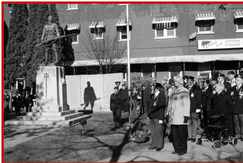
Cheryl Gallant honouring the fallen at Pembroke Legion Branch 72