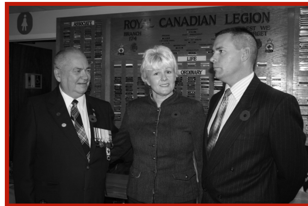
MP Cheryl Gallant visiting Arnprior Legion Branch 174