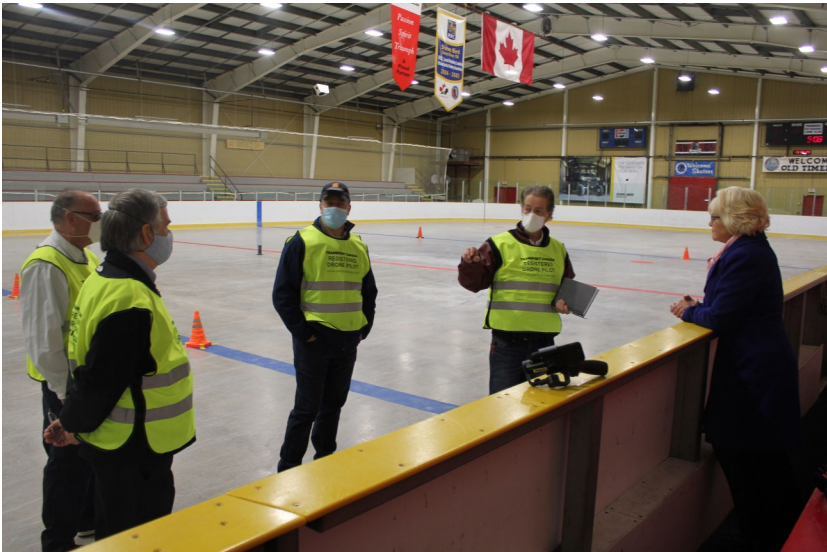
Attending a demonstration in Deep River of Canadian Companies coming together to design/build/develop & take to market a COVID-19 cleaning drone.