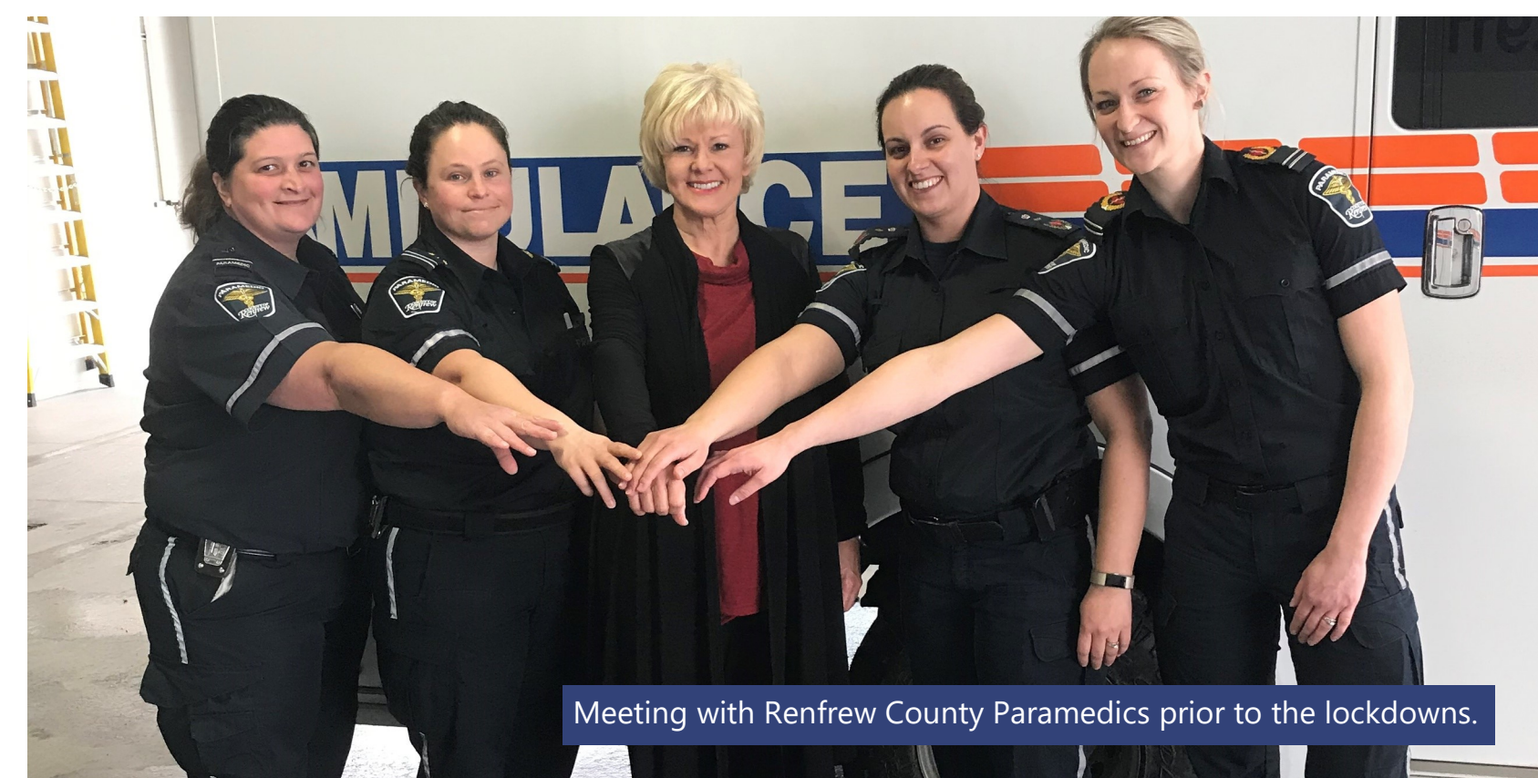
Meeting with Renfrew County Paramedics prior to the lockdowns.

It is clear, as long leadership in Ottawa is absent, Canada will be in worse shape than when we entered the crisis with a withering economy.